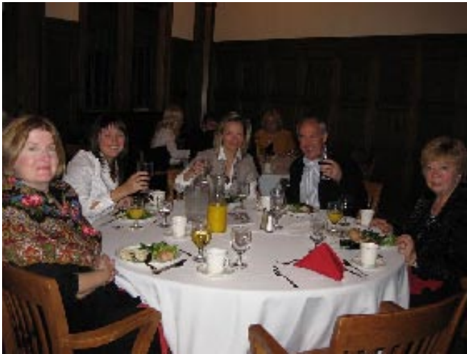
Russian visitors and homestay hosts at the Farewell Dinner

Opening your doors to our international visitors and helping them experience American ways of life are acts that are worth more than