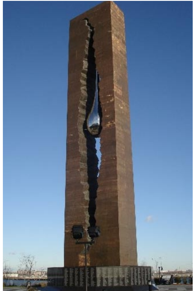
Memorial to the “struggle against world terrorism” in Bayonne, New Jersey, a gift from the Russian people in memory of the terrorist attack on the World Trade Center. Sculptor, Zurab Tsereteli.

The monument, 100 feet high, is made of steel and sheathed in bronze. In the center is a jagged tear in which hangs a 40 foot high stainless steel teardrop. Etched into the 11-sided stone base are the names of the nearly 3,000 people killed in both the 1993 bombing of the World Trade Center and the terrorist attack on September 11, 2001. It is located in Harbor View Park on a man-made peninsula formerly known as Military Ocean Terminal. The site has a direct view of the Statue of Liberty on Liberty Island and Lower Manhattan where the twin towers of the World Trade Center stood. The design was conceived when the artist Zurab Tsereteli, struck by the outpouring of grief he observed, formed the image of a teardrop in his mind. Shortly after the attacks, Tsereteli visited ground zero and looked to New Jersey’s waterfront for an appropriate site for a monument. Bayonne was an arrival point for many New York City evacuees on 9/11 and a staging area for rescuers.