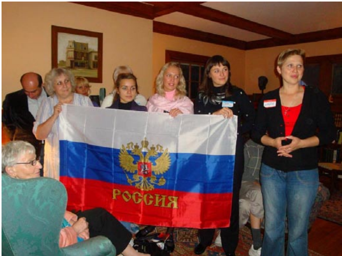
Russian visitors giving a cultural presentation for ICW members and friends

November 18, 2009 , ICW helped design a program for 11 delegates from Germany under the invitation of the U.S. Department of State's International Visitor Leadership Program titled "Workforce Development in Renewable Energies and Energy Efficiency in the U.S." Visitors visited Mount Wachusett